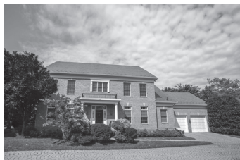
23 Beman Woods Court Sought After Prescott at Avenel OFFERED AT $1,349,000

3201 New Mexico Ave. NW Suite 220 Washington, D.C. 20016 202-944-5000