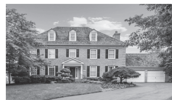
9301 Crimson Leaf Terrace Mitchell & Best Residence SOLD AT $1,430,000

Ranked as one of the Top 10 Agents in the USA by Individual Sales Volume by Real Trends, as Advertised in the Wall Street Journal in 2007