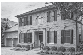
24 Sandalfoot Court Deck w/ Automatic Awning OFFERED AT $1,198,000