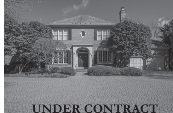
UNDER CONTRACT 18 Beman Woods Court 1 st Floor Master on 16/17 th Fairway OFFERED at $1,525,000