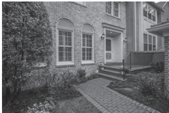
8302 Turnberry Court 14 th Fairway Views OFFERED AT $1,149,000