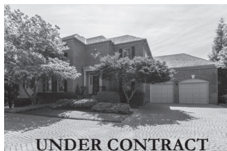
UNDER CONTRACT 9728 Beman Woods Way Soaring Views of Golf Course OFFERED AT $1,425,000